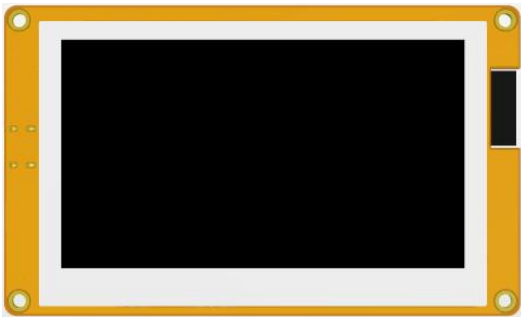
Figure 3.1 Module Hardware Resources

The hardware resources of the module are shown in the following two figures::