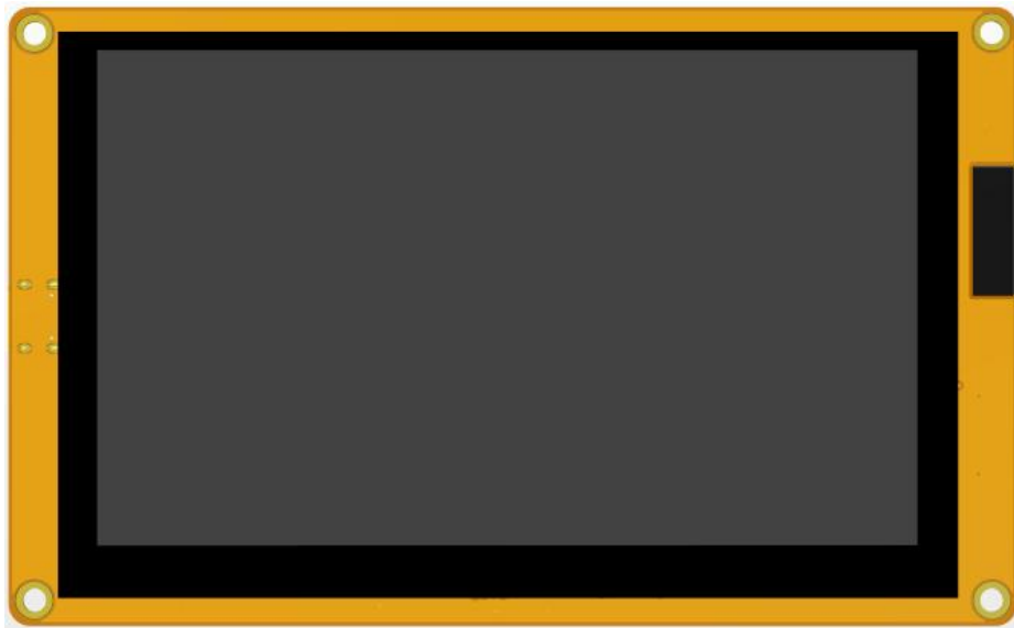
Figure 3.1 Module Hardware Resources

The hardware resources of the module are shown in the following two figures::